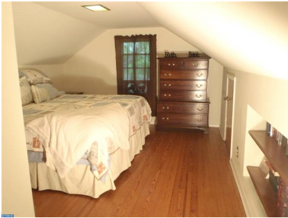
Bedroom - Main