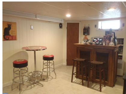
Basement - Finished